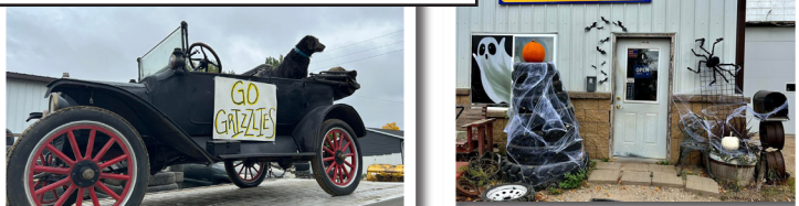
Cal's Repair & Towing

Visit https://www.calsrepairsommitsd.com and like them on Facebook.