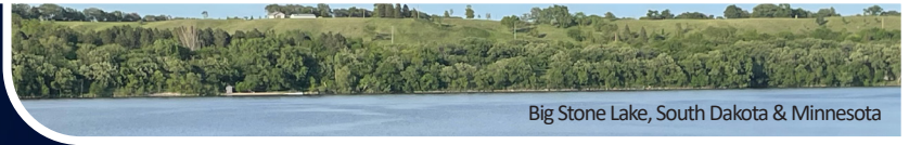
Big Stone Lake, South Dakota & Minnesota