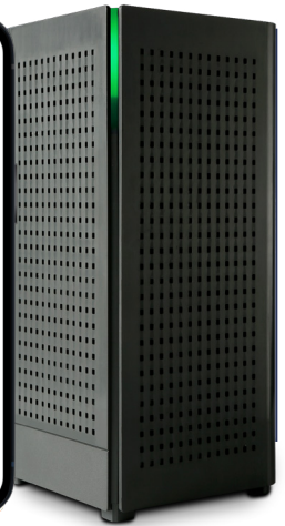
The Ultimate Wi-Fi Experience! BLAST Router with the CommandIQ app

It's not your basic Wi-Fi, PREMIUM WI-FI , is next generation Wi-Fi 6. The most advanced technology delivered by RC Technologies' BLAST router. Premium Wi-Fi is everything you ever wanted in Wi-Fi and more!