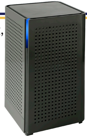
GigaSpire BLAST 6

The GigaSpire BLAST 6 (shown right) offers the ultimate Wi-Fi experience for online activities and those bandwidth-hungry applications. Speed and coverage is just the beginning of the things GigaSpire BLAST 6 can do, it's equipped with the latest advancements in wi-fi technology, including the 802.11ax Wi-Fi standard, also known as 'Wi-Fi 6'.